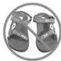
Sandals or Slippers

Participants are requested to arrive in a timely fashion for all addresses, whether to their own, or to those of other presenters. Presenters are reminded that the time slots should be divided fairly and equally between the number of presentations, and that they should not overrun. The session chair is asked to assume this timekeeping role and summarize clarify key important issues in each topic